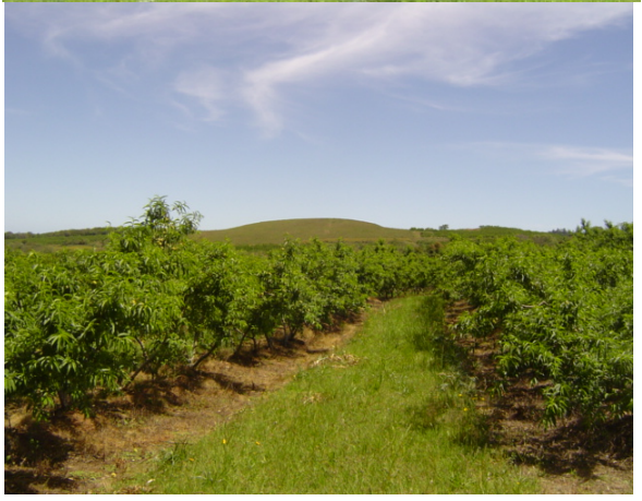
Experimental Agronomic Centre