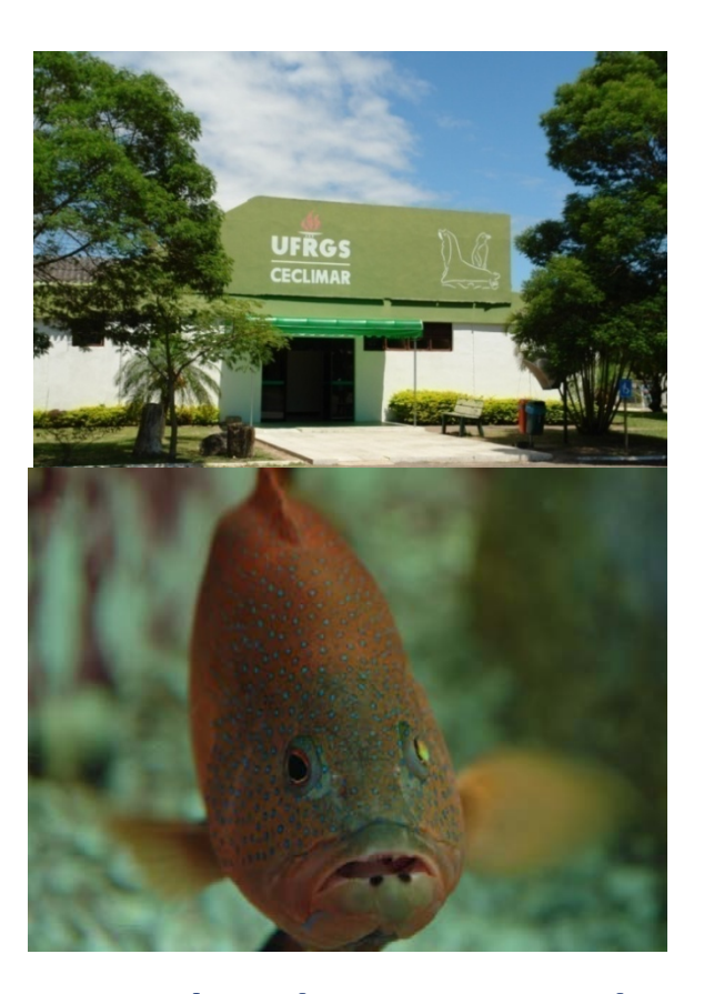
Coastal and Marine Study Centre