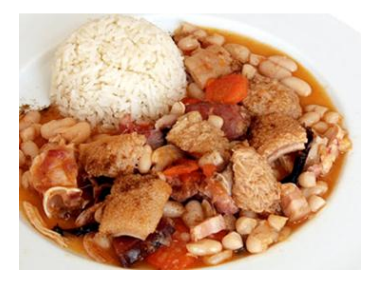
Photo: Tripas à moda do porto (http://www.mundolusiada.com.br/gastronomia/almoco-divulga-tripas-a-moda-do-porto-entre-as-7-maravilhas-da-gastronomia/)

The dish is made with several kinds of meat, tripe, sausages and white beans. The sauce is delicious!