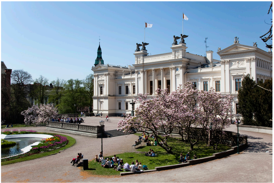
Lund University | May 2013